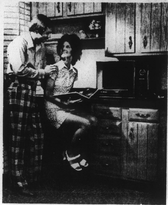
NEW WAYS OF PREPARING MEALS, such as microwave cooking, will interest brides concerned with convenience and saving time. The cooking time chart located on the front of the Jet 82 countertop microwave oven by General Electric and the microwave cookbook provided with it can help.

After using a JET 82, it won't be long before she finds she has more than one friend in the kitchen.