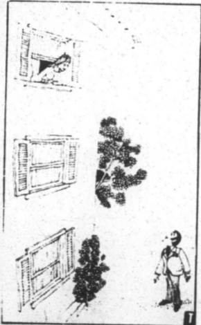
"I have the Charger but who has the ladder?"