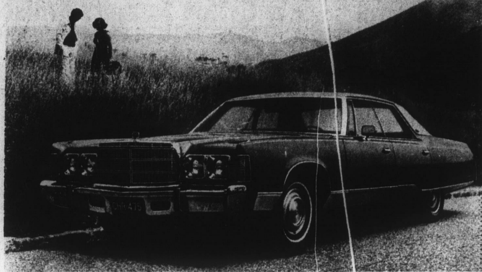
DESIGN REFINEMENTS—Chrysler's nameplate car line receives new design treatment plus extended convenience and quality items for 1975. New Yorker Brougham, above, features refined grille design and new luxury interior styles and exterior colors.