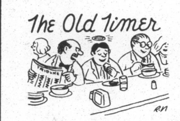
"Blessed are they who have nothing to say, and who cannot be persuaded to say it."