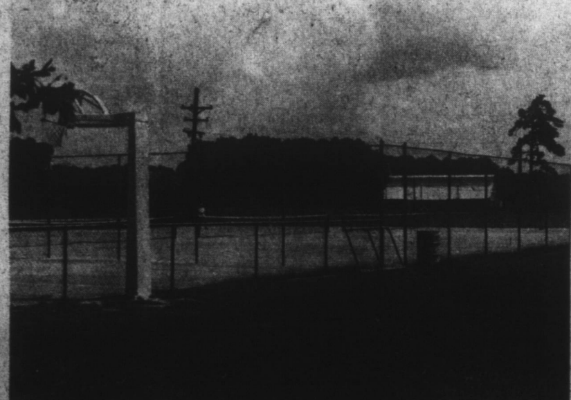
FACILITIES AT CHOWAN—The Edenton-Chowan Recreation Department is now operating a youth center at Chowan High School similar to the one at National Guard Armory in Edenton. Pictured above left are the new outdoor facilities which include

Proceeds will go to support the Boy Scout Program. The local civic club sponsors a troop.