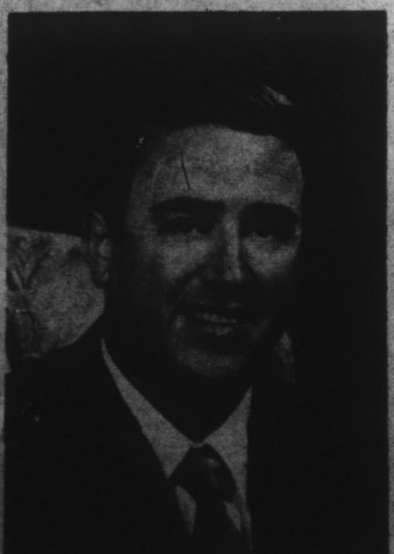
ROBERT W. SCOTT

An afternoon and evening meeting of the Albemarle Area Development Association will be held at First Colony Farms in