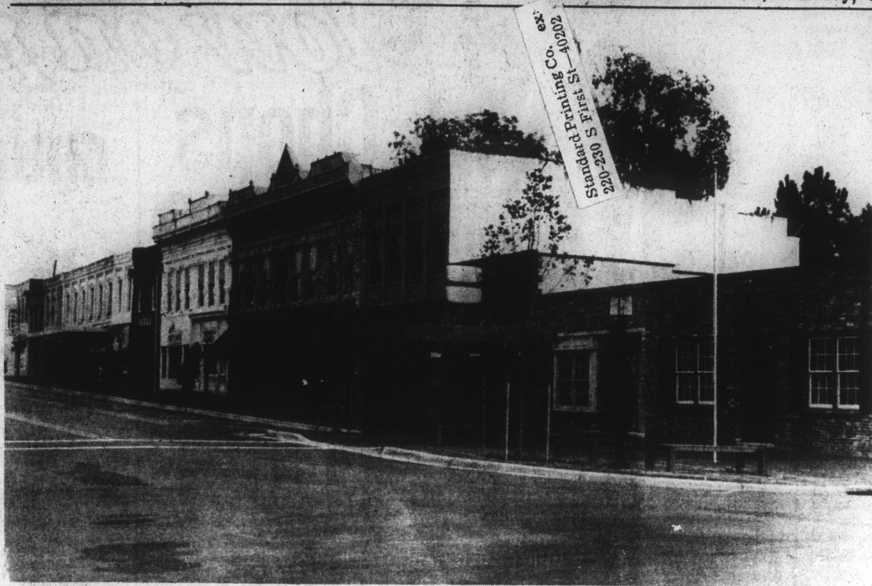
DOWNTOWN EDENTON'S NEW LOOK —This view of "cheap side" in downtown Edenton is typical of the new look provided for the three-block area between Queen and Water streets. Holly bushes were added to the scene last week joining tulip poplars along the street. This picture, taken Sunday, is a typical section of the project, showing an arbor, benches, street lights and flag poles along the brick sidewalks and newly surfaced streets.