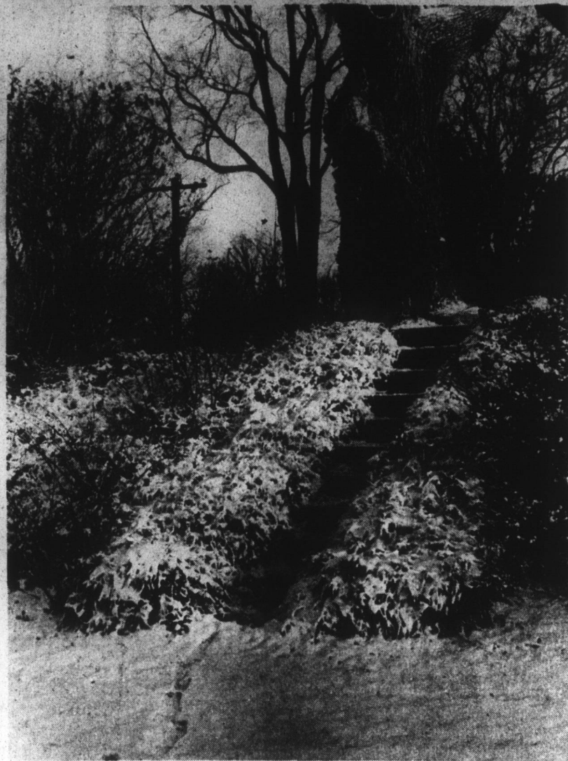
FROZEN BEAUTY —The Albemarle Area was wrapped up over the weekend with an unexpected snowfall and temperatures which were recorded at nine degrees Sunday and Monday. There was no evidence of sunshine Saturday, but Sunday morning it rose to provide shutter bugs in Historic Edenton with a pretty