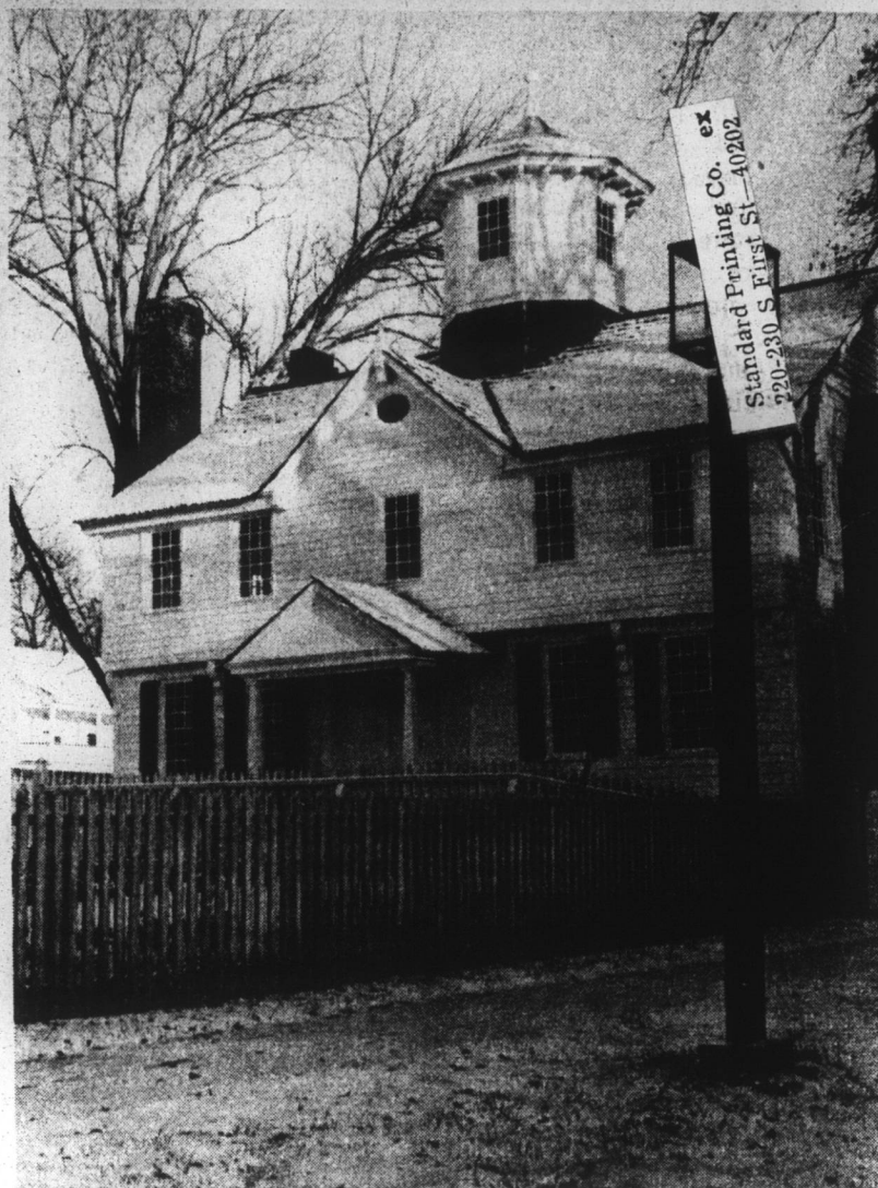
subject. The picture at left was taken from Water Street, showing a back entrance to Pembroke Hall. The familiar scene at right shows the Cupola House, new fence and all, with the handsome new downtown light post standing sentry.