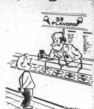
"Mind going over them again... there were a couple that sounded good."