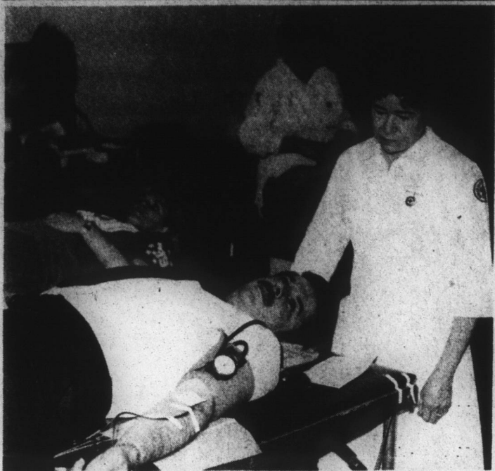
DURING BLOODMOBILE VISIT—The Herald photographer was on hand March 8 when the American Red Cross Bloodmobile paid a regular visit to Edenton Baptist Church. In the picture at right, prospective donors are registered by volunteers. The next picture shows donors being interviewed by nurses to determine if they qualify to give blood. Gary