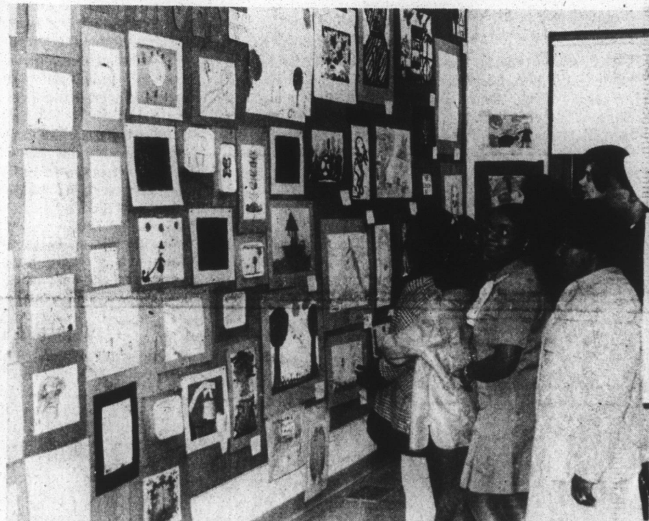
PARENTS VIEW EXHIBIT—Edenton Girl Scouts presented an art display, "Images '76", to their parents last Tuesday night at Shepard-Pruden Memorial Library. The exhibit included paintings in various media, built around the Bicentennial theme as part of the Girl Scout Week observance.