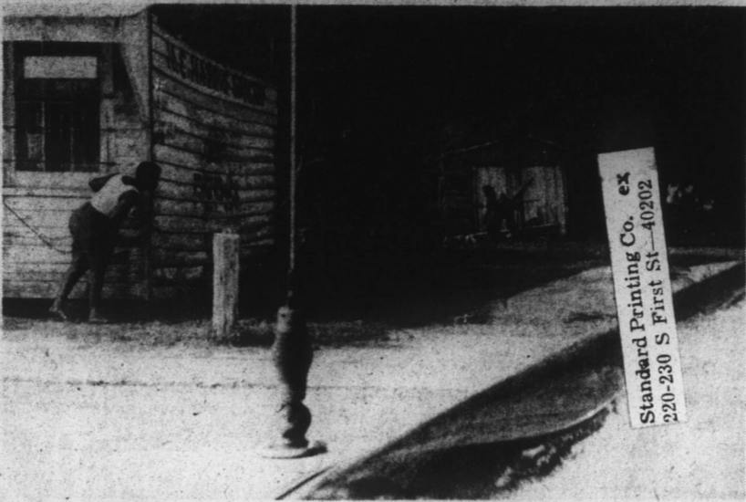
Street where they were confronted by Edenton policemen. The center picture shows a curious bystander looking around the corner of a building as officers search the area. SBI Agent Bill Godley and Capt. C. H. Williams are pictured at right as they seriously discuss the next move.