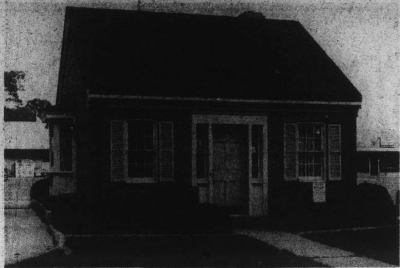
ROBBERY SCENE AND SITE OF SHOOTING —The drive-in branch of Peoples Bank & Trust Company at Mitchener Village on North Broad Street was a different scene Wednesday morning than the afternoon and evening before. The bank was robbed and two bandits fled down Freemason