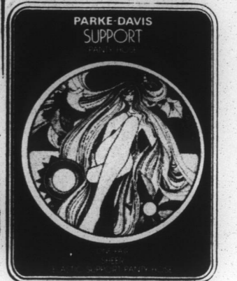
Hollowell & Blount Rexall Drugs 482-2127 — EDENTON