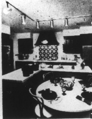
A GOOD LOOKING KITCHEN should be seen in a good light by Power-Trac.

You can cook up a new look for your kitchen that won't take too big a bite out of your budget. A new way to light up your cooking life is with track lighting. Once found only in art galleries, museums or store windows, it's now made to throw light on your range, sink, work counter or dining area, so you can get a good look at the good things you cook.