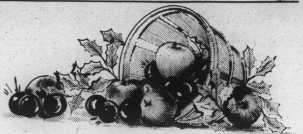
GREEN APPLES AND SHINY RED Christmas balls spill out of peach basket for unusual decorative arrangement.

Everyone gets into the act at this favorite Christmas party. Invite dear friends and relatives for a heart-warming evening for all. The hostess heaps baskets with ribbons, popcorn, colored papers and cellophane, foil, seals, bells, colored yarns, scissors, glue, whatever. Each one makes ornaments from whatever suits his or her fancy, and then uses them to trim the tree. Prizes can be awarded for the funniest, prettiest, or cleverest ornament. After light refreshments, guests take home one or two of their creations for their own tree.