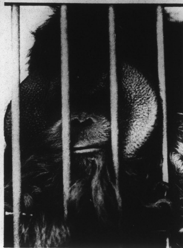
CIRCUS ATTRACTION — Go-Go, a giant red orangutang — one of the rarest creatures on earth — whose head is two feet in length, is coming to Edenton on May 13 with Hoxie's Great American Circus. Their famous menagerie also features Kongo, the largest gorilla on tour.

Advance tickets may be purchased from members of the John A. Holmes High School Chess Club and SGA.