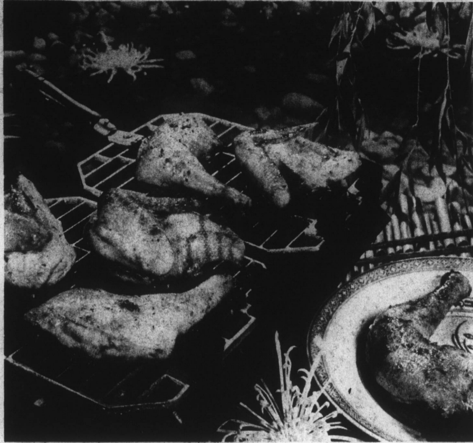
ORIENTAL STYLE — Chicken goes Oriental when marinated with an easy soy-mustard sauce and grilled on an hibachi. Introduce your family to Oriental style cooking.