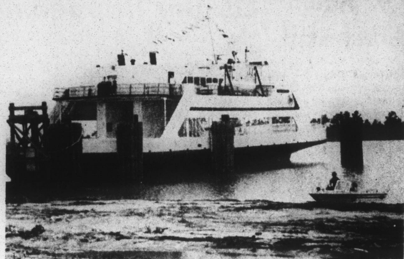
PUT INTO SERVICE — Here is the newest member of the Tar Heel fleet — the ferry Gov. Edward Hyde which was dedicated Saturday at Swan Quarter. In lower right is the sentinel, a Wildlife Commission boat.