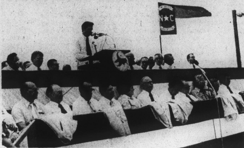
ADDRESSES THROU — Gov. James B. Hunt, Jr., accompanied by a two-tier stand of dignitaries; speaks to more than 1,000 people at Swan Quarter during Saturday's dedication of a new ferry to run between the Hyde County seat and Ocracoke.

As a public service a budget summary is found on page 3 of today's newspaper.