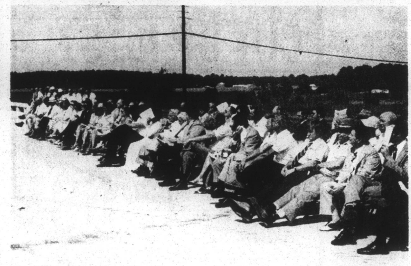
WITNESS OPENING —Pictured here is a part of the crowd that turned out for Monday's by-pass dedication. It was held at the highway's intersection with Highway 32, just north of Chowan Hospital.

The new mailing address for ARPD will be Box 646, Hertford. A new telephone number has not been made available.