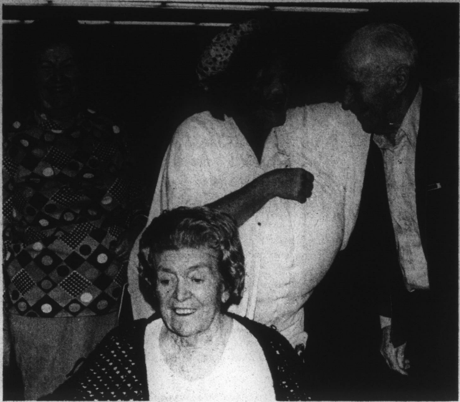
PARTY DAY AT THE HAVEN —Residents and staff members at Cape Colony Haven on Paradise Road took the afternoon off last Wednesday to enjoy some Halloween festivities. Games, prizes, and food marked the light occasion which was punctuated with activities such as that pictured above.