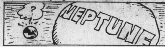
The planet Neptune is 17.3 times larger than the earth.