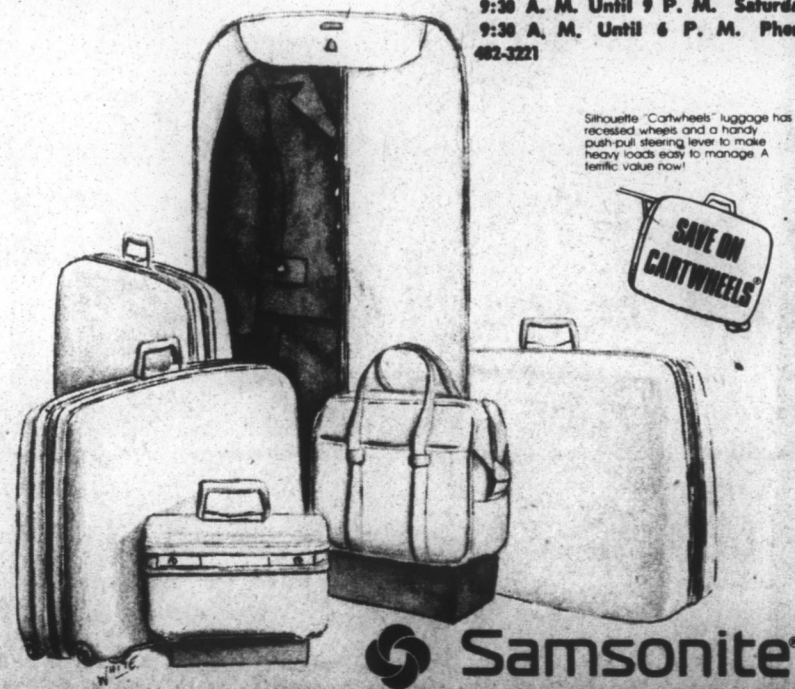
Silhouette "Cartwheels" luggage has recessed wheels and a handy push-out steering lever to make heavy loads easy to manage. A terrific value now!

Shop Monday Through Thursday 9:30 A. M. Until 5:30 P. M. Friday 9:30 A. M. Until 9 P. M. Saturday 9:30 A. M. Until 6 P. M. Phone 482-3221