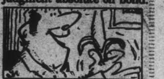
According to the Department of Agriculture, Americans eat more bananas than any other fruit.