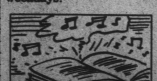
Writer James Joyce was also a talented musician.

The Elizabeth City Social Security office is located at 111 Jordan Plaza next to Southgate Mall (phone 338-2161) and is open 9:00 to 4:30 weekdays.