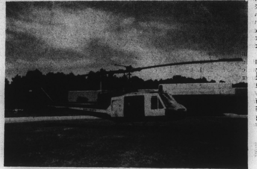
KEY TO PROGRAM—An Army surplus helicopter will be used for the emergency transportation program. The helicopter is owned by Dare County and was obtained by Albemarle Associates of Edenton.

The program will serve Beaufort, Bertie, Camden, Carteret, Chowan, Craven, Currituck, Dare, Gates, Halifax, Hertford, Hyde, Martin, Pamlico, Pasquotank, Perquimans, Pitt, Tyrrell and Washington counties.