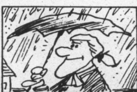
The first umbrella in the U.S. is believed to have been used in Windsor Conn. in 1740. It produced a riot of merriment and derision.

For the period October 9-12 gross tobacco sales on South Carolina and Border North Carolina Belt totaled 16.4 million pounds and averaged $135.43 per hundred; Eastern Belt 27.9 million pounds and averaged $140.24; Old and Middle Belt 24.7 million pounds were sold for an average of $144.69 per hundred. For this period the Stabilization Corporation received 3.1 per cent on the Border Belt, 1.3 per cent on the Eastern Belt and .8 per cent on the Old and Middle Belt.