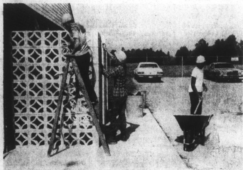
AQUARIUM TO RE-OPEN — Members of the Young Adult Conservation Corps are pictured above completing masonry work at the Edenton Fish Hatchery which is scheduled to re-open its aquarium in the near future. The youth workers built sunscreens for the aquarium and rest room entrances as well as painted the aquarium interior.

The president reported that although "money is short," there were 50 to 60 new chicken houses scheduled for construction in the immediate future.