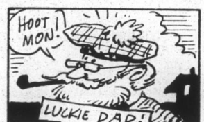
In Scotland, a grandfather is sometimes called a luckie dad .