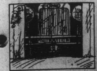
The first Ford automobile had to wait over an hour for its first test run, since it was built in a shed, and was wider than the shed door.