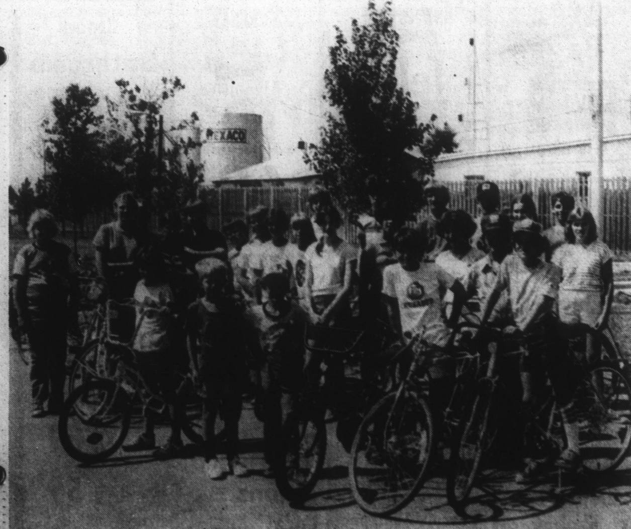
HALF-WAY HOME — Pictured above are youngsters from Rocky Hock Baptist Church who participated in the 20-mile Bike-A-Thon last Saturday. The event was staged for benefit of three local families and netted $2500.00.