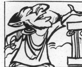
"Rhetoric, the skillful use of words to influence or persuade others, comes from the Greek word meaning 'orator.'"