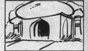
India's Taj Mahal, one of the world's most beautiful buildings, took 20 years to build.

I share with you these gems of growing, sharing, caring. These she gave with love abounding and by so doing has made many lives a little brighter by our being able to take from our storehouse of memories