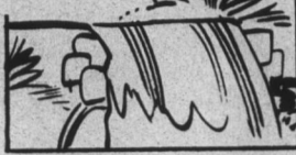
Angel Falls in Southern Venezuela is the highest waterfall in the world at 3,212 feet.

January 6 — Apple sauce, sausage biscuit and milk. Pizza, buttered corn, pears, oatmeal-raisin cookies and milk.