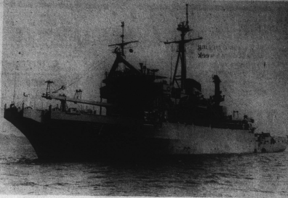
USS EDENTON (ATS 1)