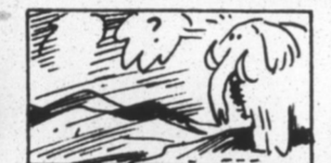
Most geologists believe the Great Lakes were once river valleys enlarged by glaciers during the Ice Age.