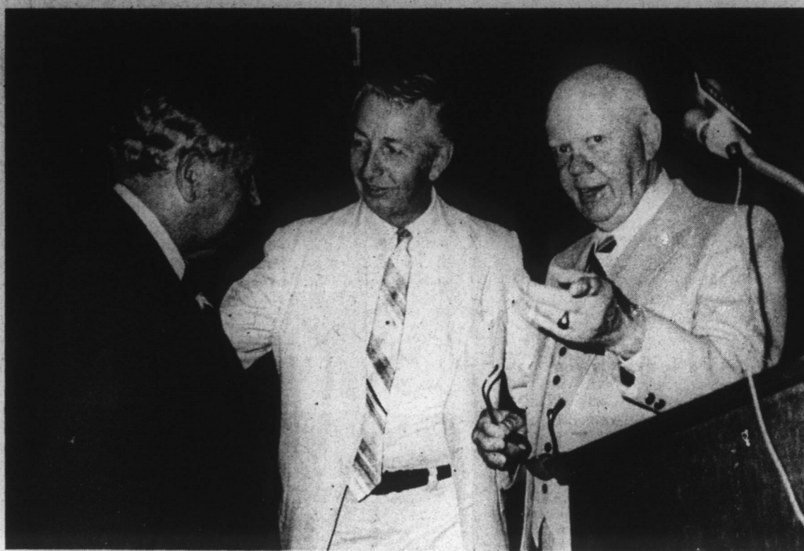
ALO SPRING MEETING — The Albemarle Law and Order Association held its spring dinner meeting at the Seafare Restaurant in Nags Head, Friday night. Among the 250 persons attending were, in the left photo from the left, Congressman