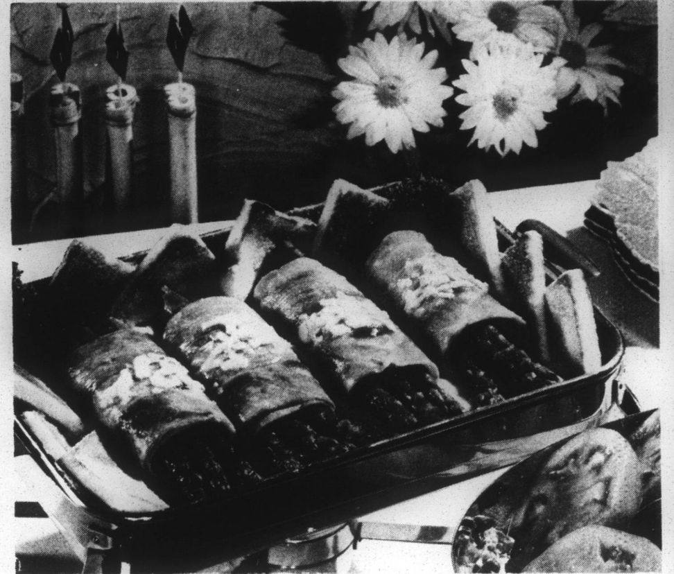
MAIN DISH — Asparagus spears rolled in ham and served with a creamy cheese sauce makes a lovely entree for patio dining.