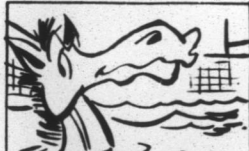
The Rinconada Racetrack in Venezuela has a swimming pool for horses.

Relatives and friends are invited to attend.