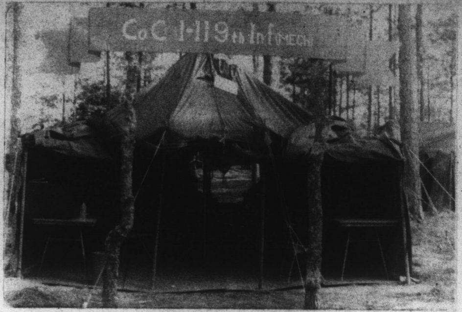
Headquarters of C Company.

FORT BRAGG, N.C. — Members of Edenton (Detachment 1) and Elizabeth City's (Company C-), 119th Infantry recently completed two weeks of active duty training here.