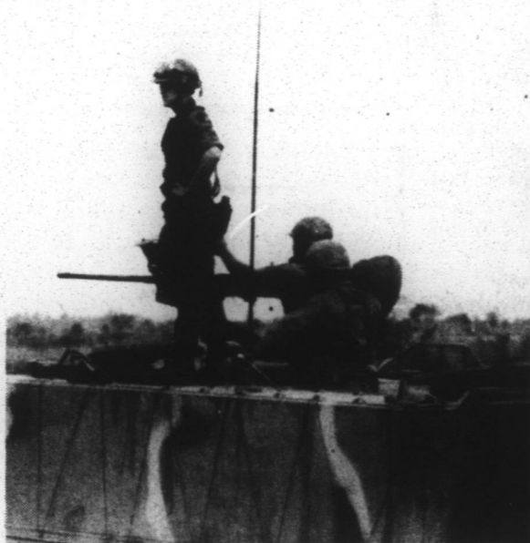
Where did that round hit?