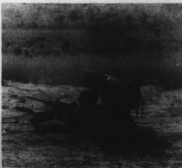
Guardsmen practice on the Familiarization Range, using 50 caliber machine guns.