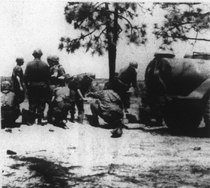
The Company chow line.