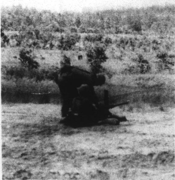
... Still more machine gun practice!

The remainder of the training period was spent with guardsmen sharpening their skills in tactical maneuvers and weapons usage.