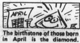
The birthstone of those born in April is the diamond.