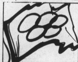
The first American to enter the Olympic Pentathlon was George Patton, later General Patton.

Williford - Barham Funeral Home was in charge of the arrangements.