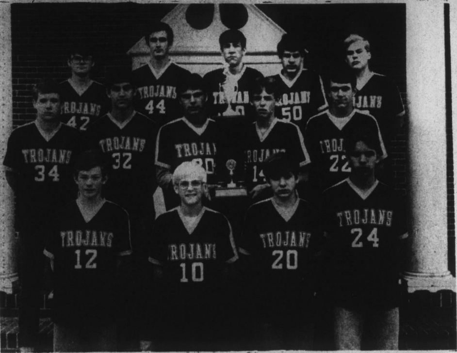
Trojans Win State Championship — The Immanuel Christian Trojans defeated Community Christian School recently to become the first team from the Northeast Conference to win the State Championship. The final score was 45-26 in favor of the Trojans.