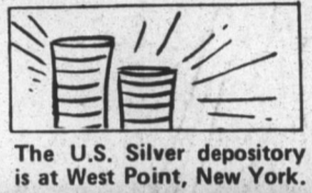
The U.S. Silver depository is at West Point, New York.