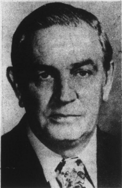
Rep. Walter B. Jones

The hands that rocks the cradle are the hands that rule the world.