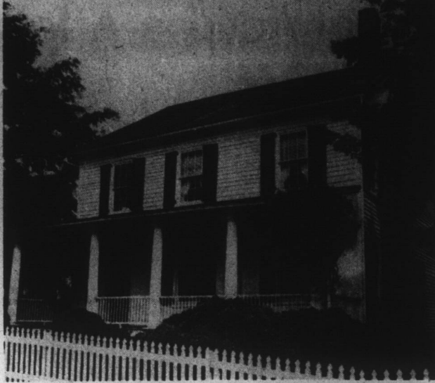
SALISBURY OCTOBER TOUR - This handsome Federal-style Maxwell Chambers House will be open for October Tour visitors.

Gustave Eiffel, who built the Eiffel Tower, also designed the right arm of the Statue of Liberty.