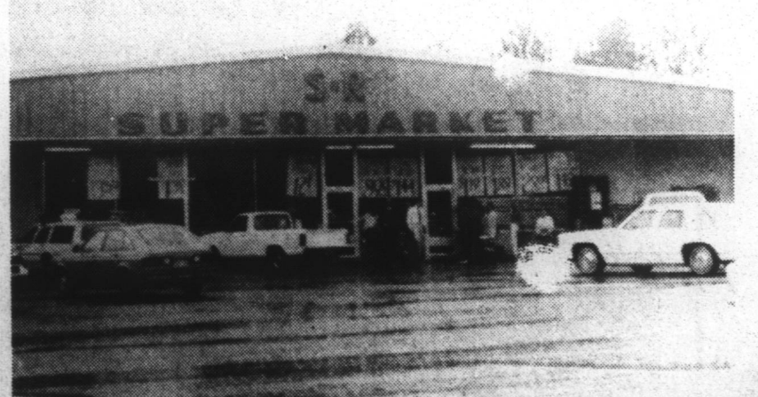
S&R ROBBED—An undetermined amount of money was stolen from the ripped safe. The SBI and the Edenton Police Department are continuing to investigate.

No further details are available at the present time.