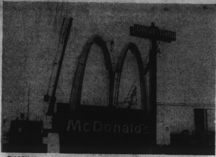
RAISING THE SIGN—Workers prepare to raise the golden arches for the new McDonald's which will be on 32 North across from Chowan Hospital.