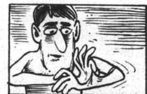
The average adult has about 3,500 square inches of skin. The skin has roughly a billion pores.