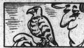
A young hawk is called an eyas.