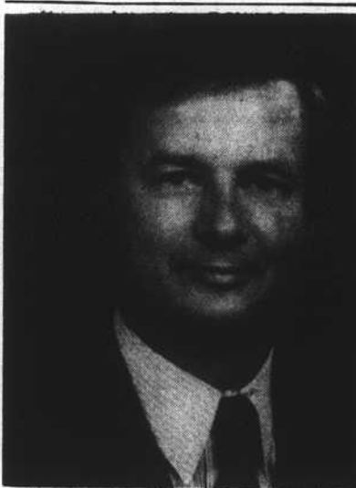
James B. Hunt