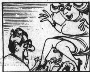
Americans spend some $100 billion a year on shoes.

Friends and relatives are invited to attend. No invitations are being sent.