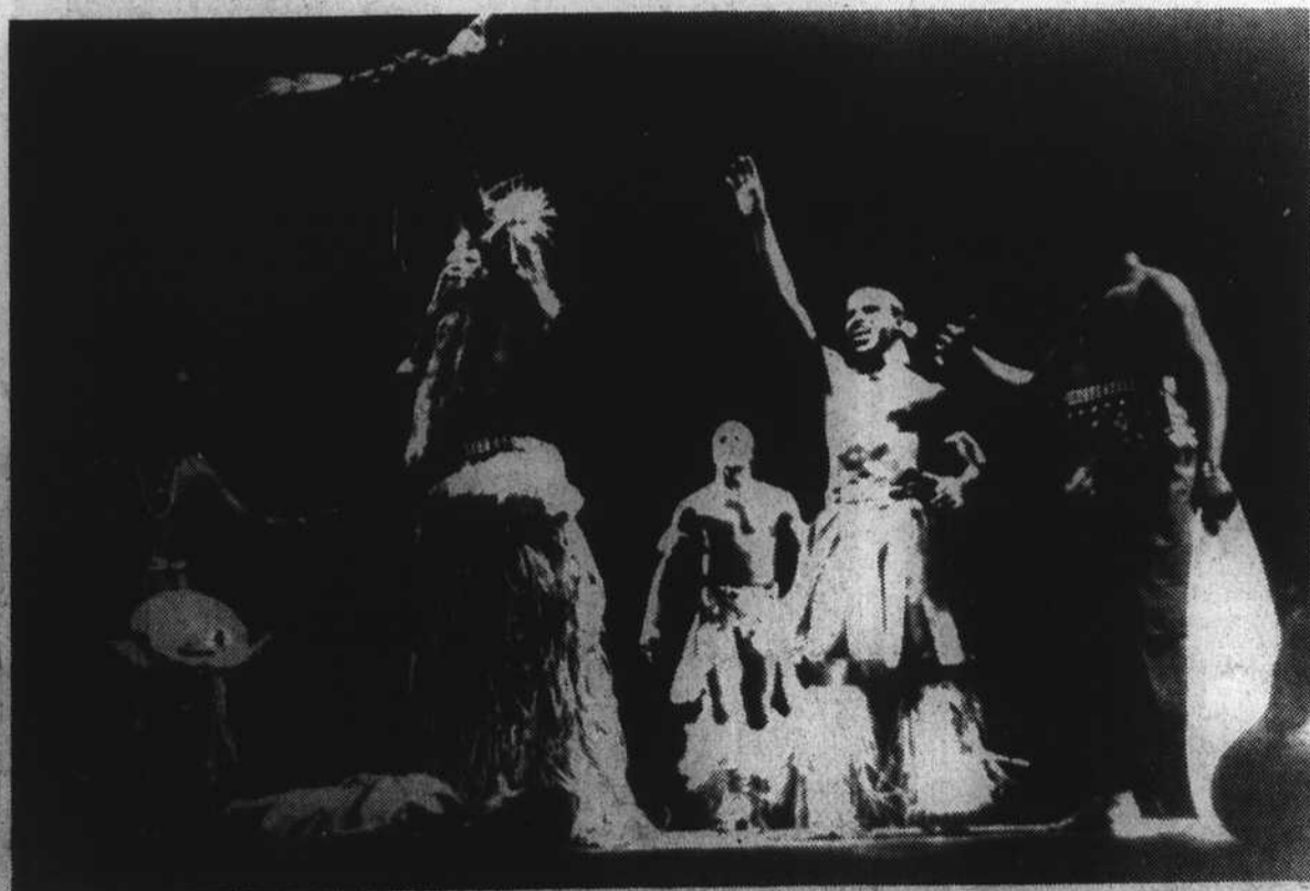
HERITAGE TOUR—The African-American Dance Ensemble will make a special appearance this Saturday night, April 13 at John A. Holmes High School Auditorium as part of the North Carolina Black Folk Heritage Tour. The Durham based ensemble is noted for its ability to involve audiences directly in the experience of African cultural expression.