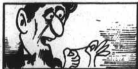
With a fine pen and a microscope, Lincoln's Gettysburg Address has been printed on a human hair less than three inches in length.

The meeting was adjourned with the members reciting the Jaycee Women Creed.