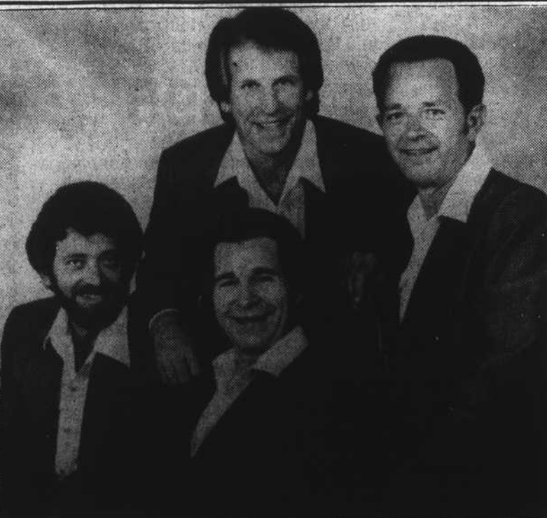
Chowan County Fair- The Pilgrims, a group specializing in good, clean, country music, will be appearing at the Chowan County Fair on Thursday, September 19 and Friday, September 20.

Plan an exciting weekend October 5-6 with the tenth annual Peanut Festival. Make plans to participate in a fun-filled weekend and attend the festival. The band needs your support!