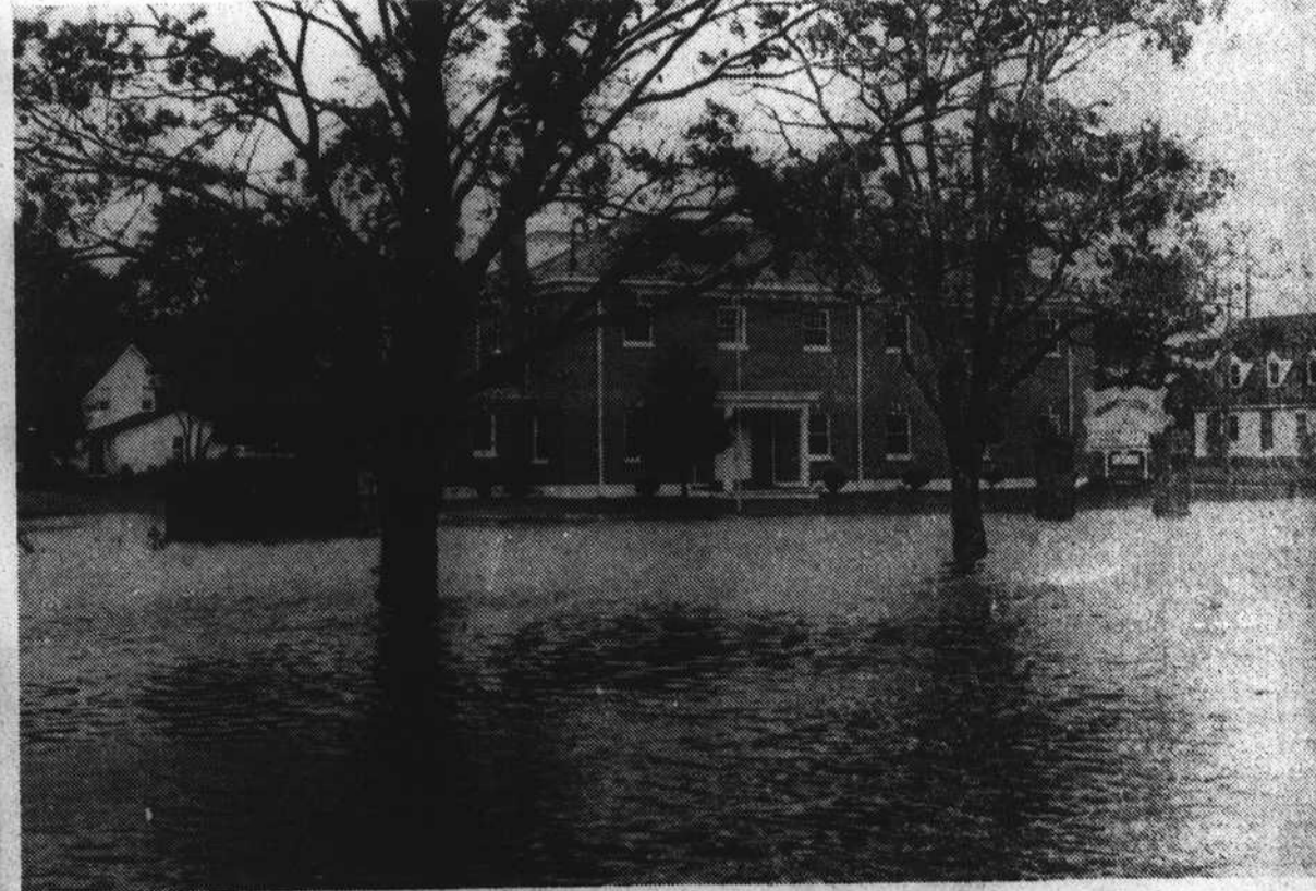
RAIN, RAIN, RAIN —The remnants of Hurricane Juan caused heavy flooding locally. The entire northeastern section of North Carolina was placed under a flood warning on Monday. There were power outages and winds gusting up to 65 mph. Pictured on the left is a view of the Barker House and on the right is Unanimity Lodge.