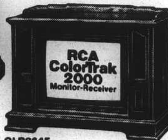
GLR2645 26" diagonal square picture tube

DON'T MISS OUT ON THIS SENSATIONAL 2-FOR-1 OFFER—COME IN NOW!